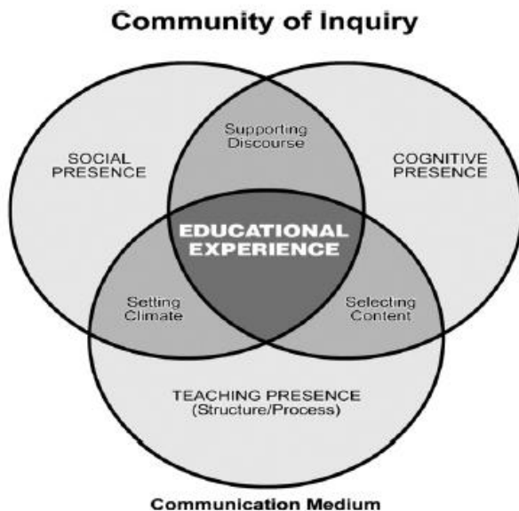
Figure 1: Community of Inquiry